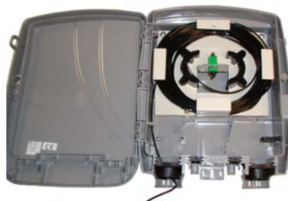
Insert With 50 ft. of FieldShield Pushable Fiber