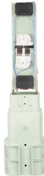
Proform Pedestal with Insert